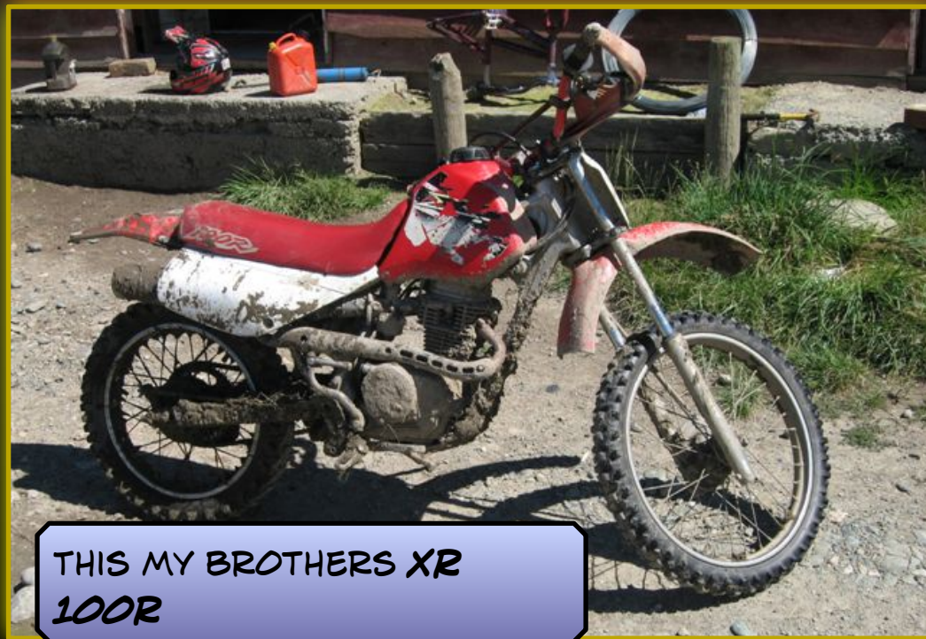
THIS MY BROTHERS XR 100R